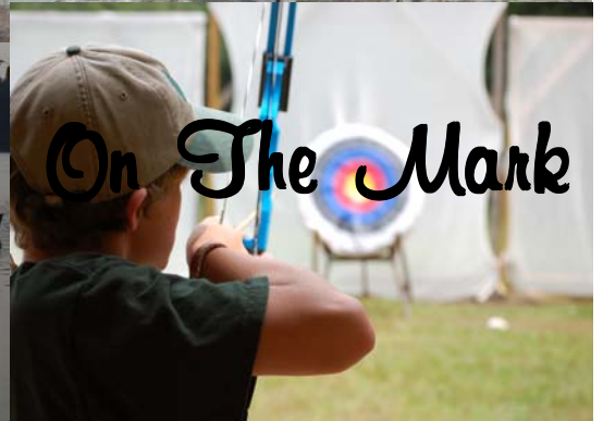
On The Mark