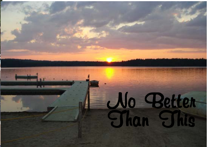
No Better Than This