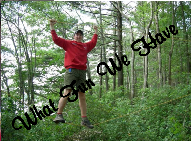
What Fun We Have