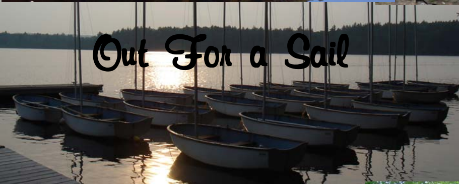
Out For a Sail